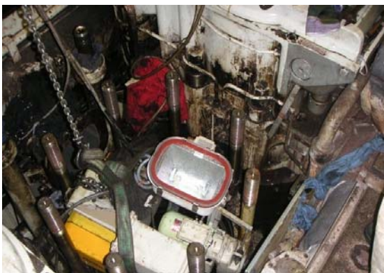
The crane mechanism lying on top of the engine.

CHIRP Comment: We are grateful to the ship manager for sharing this report. We have heard from another