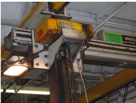
The overhead crane in its gantry.

The chain and crane operator are now in close physical contact. Two pairs of eyes are now on the critical task of monitoring crane chain tension. The turning gear can be stopped immediately should a situation arise. This negates the risk of critical communication delay, from the top to the base of engine.