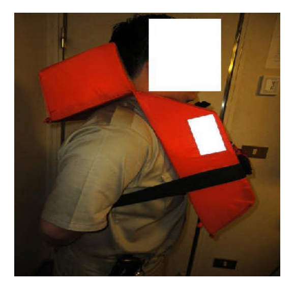
CHIRP Comment: We have drawn this to the attention of the manufacturer of this lifejacket.

Clearly these lifejackets passed the latest stringent tests required by SOLAS and have far better life saving capabilities. However they were not designed keeping in mind ease of wearing which is essential for those who work at sea.